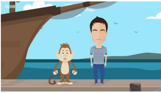
Tutorial: The big ship sails on the ally-ally-oh