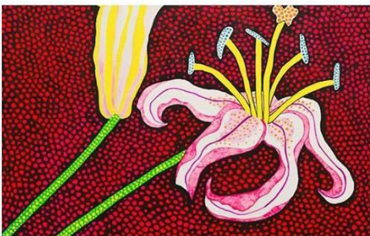
Photograph: Yayoi Kusama

Can you draw a picture in the style of this artists Yayoi Kusama?